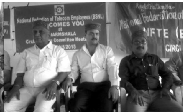
View of Dias